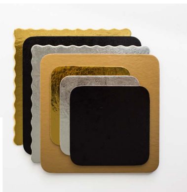
Squares, Mixed Edges